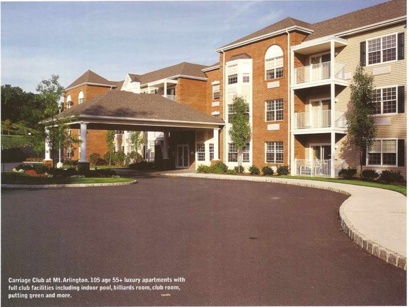
Carriage Club at Mt. Arlington. 105 age 55+ luxury apartments with full club facilities including indoor pool, billiards room, club room, putting green and more.