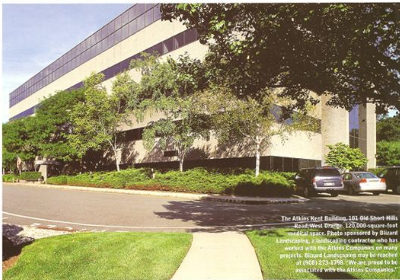
The Atkins Kent Building, 101 0th Short Hills Road, West Orange. 120,000-square-foot medical space. Photo sponsored by Blizzard Landscaping, a landscaping contractor who has worked with the Atkins Companies on many projects. Blizzard Landscaping may be reached at (908) 273-1798. "We are proud to be associated with the Atkins Companies."