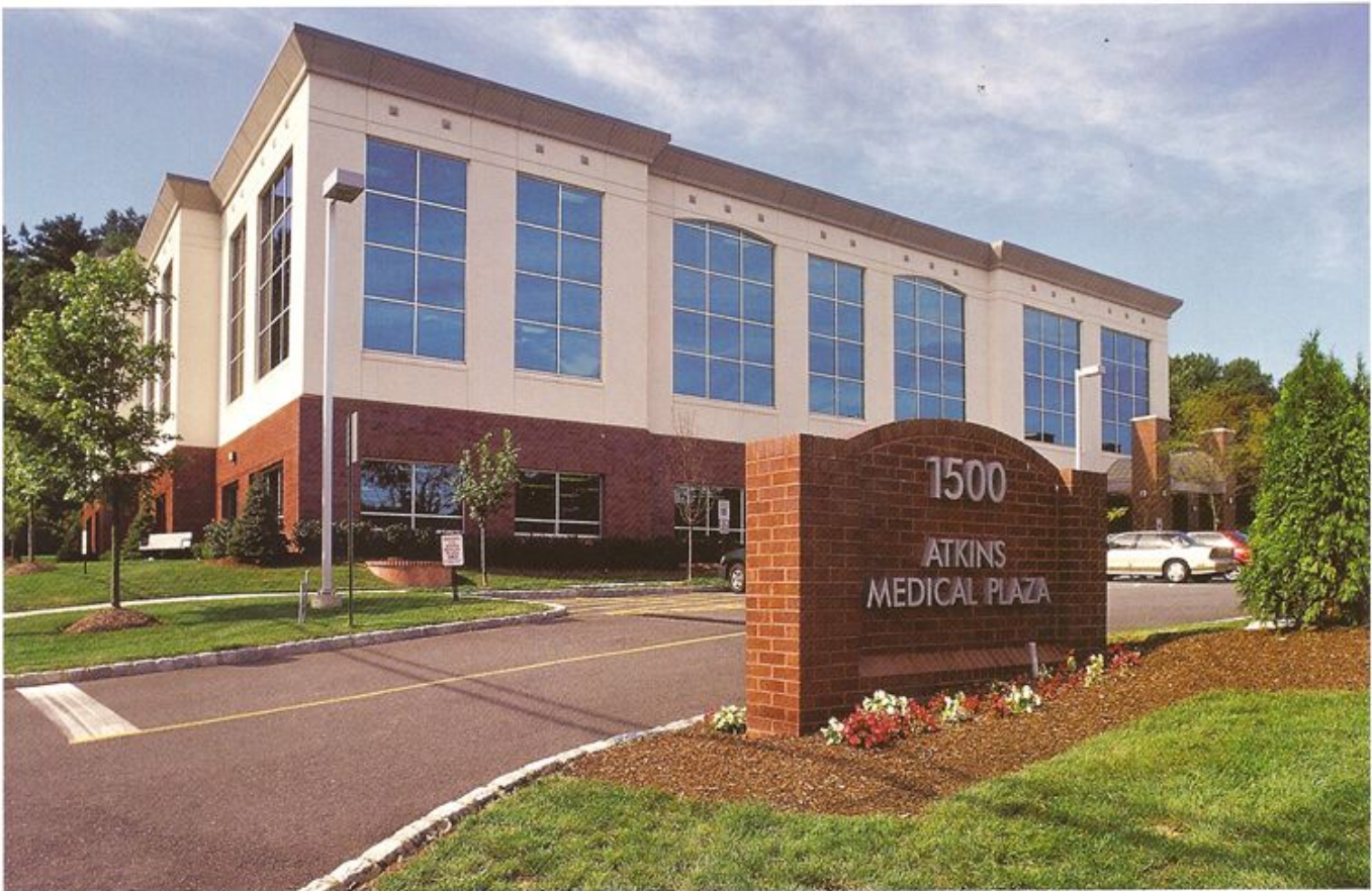
Atkins Medical Plaza. 36,000-square-foot medical space. West Orange, NJ. Photo sponsored by Clifton Glass, the designer/installer of the green-tinted windows in this building. Clifton Glass may be reached at (973) 772-7770. "We are proud to design, supply and install window systems for the Atkins Companies."

One example of this approach was the introduction of detached patio homes with full condominium ownership. This concept was well received in this region, as well as proving to be an outstanding investment for the home buyers. Homes that were initially sold for $220,000 to $250,000 five years ago are now selling for $400,000 and higher.