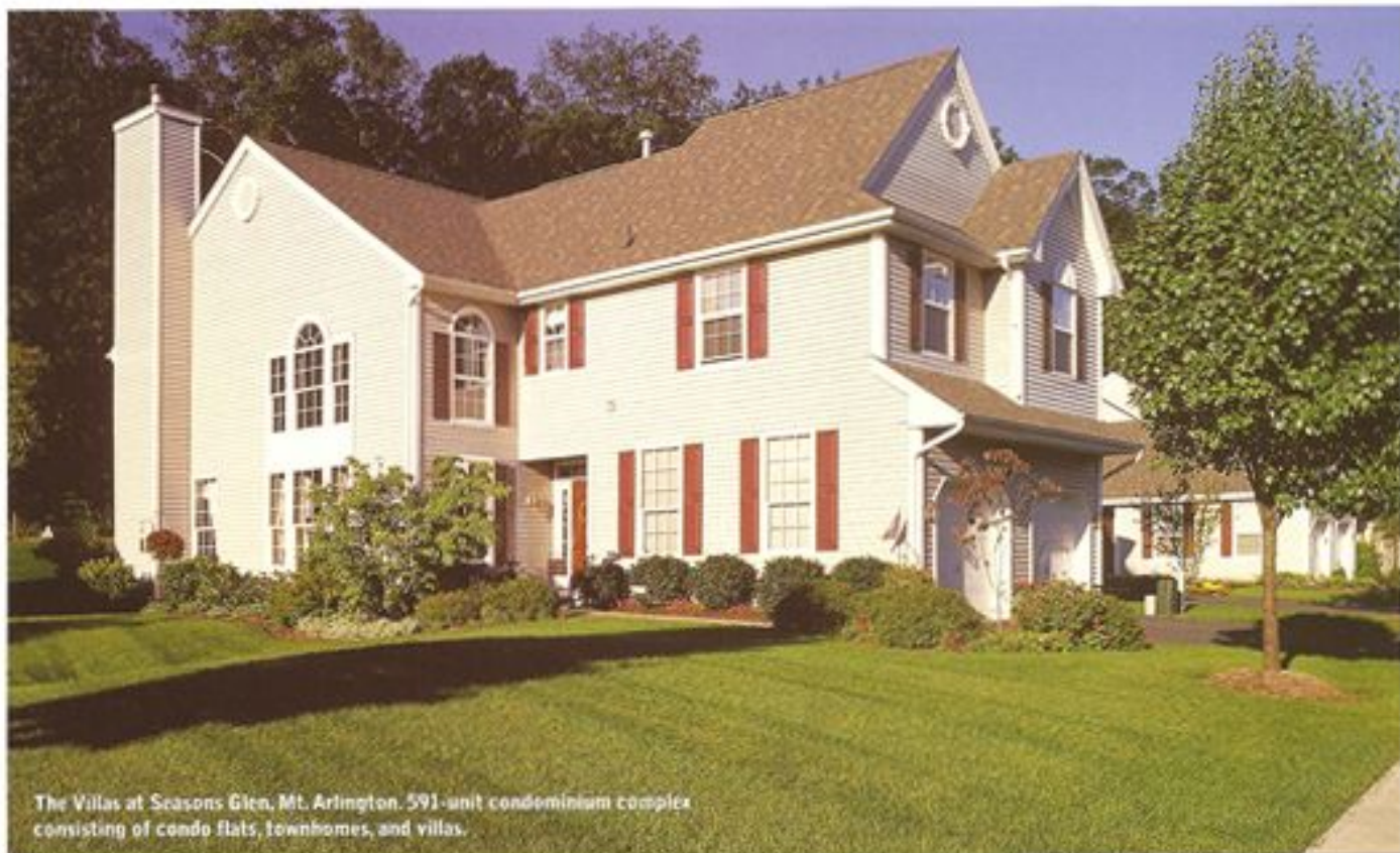
The Villas at Seasons Glen, Mt. Arlington. 591-unit condominium complex consisting of condo flats, townhomes, and villas.