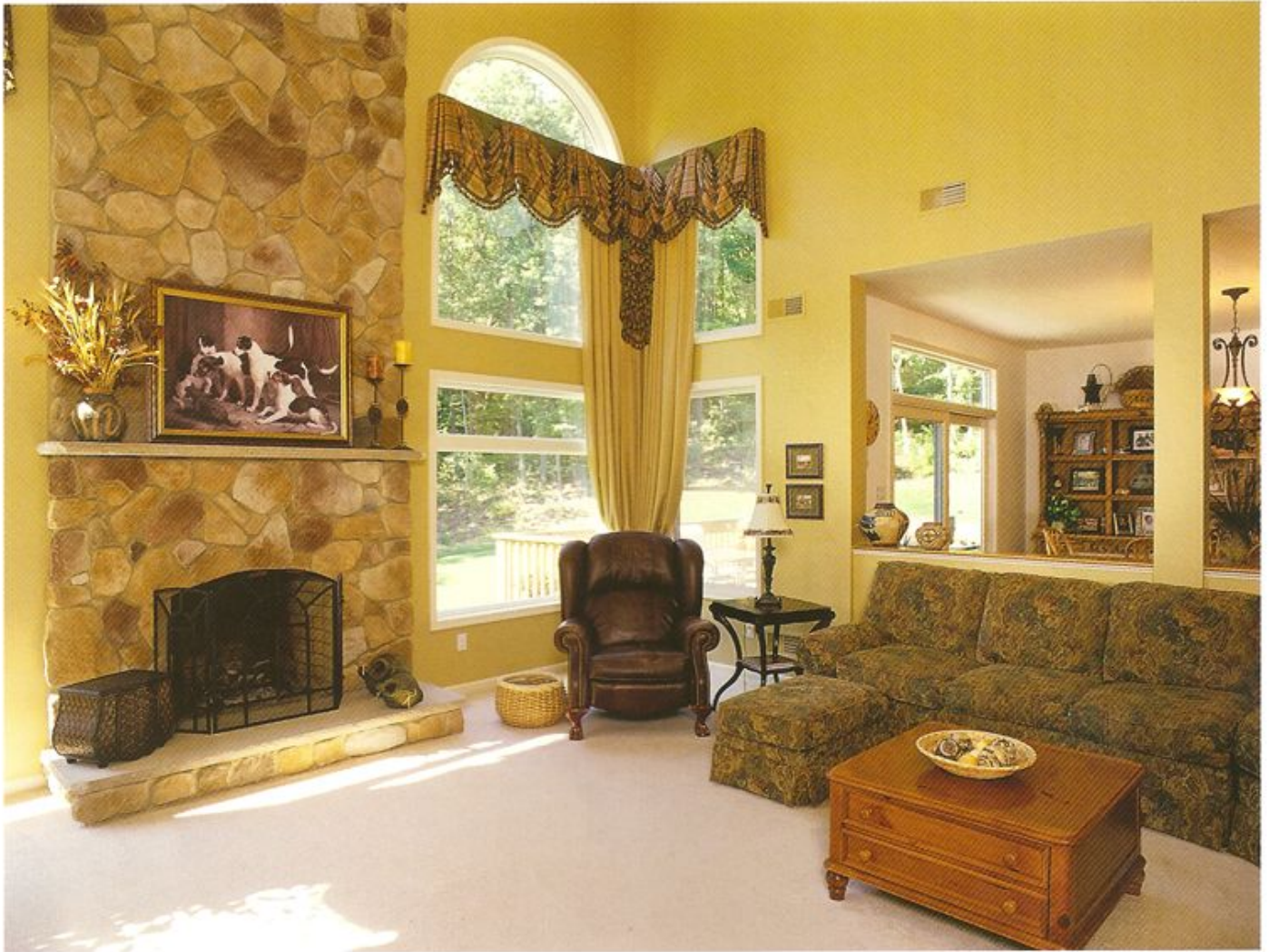
Meriden Estates, Rockaway Township. Photo sponsored by the Whirlpool Corporation. For all of your major appliance needs featuring Whirlpool, KitchenAid and Gladiator Garage Works. A recognized leader in quality and product safety-leading the industry in market share. (800) 253-1301 is our Consumer Interaction Center. www.whirlpool.com . www.GladiatorGW.com . "We wish the Atkins Companies continued success."

homes with a choice of 14 lots and five floor plans with four to six bedrooms, ranging in price from $600,000 to over $900,000. Of special note is the convenience of making customized decisions with selected contractors who can provide personalized service in assisting with design details and options.